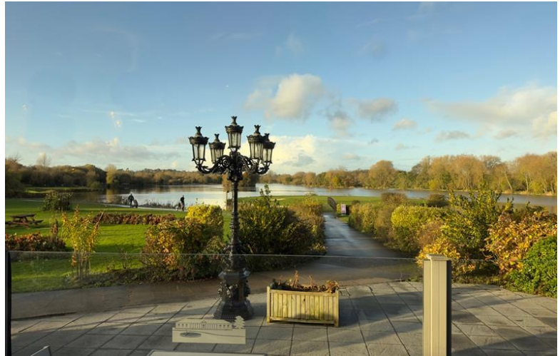
The beautiful view over the lake at the Golf Club