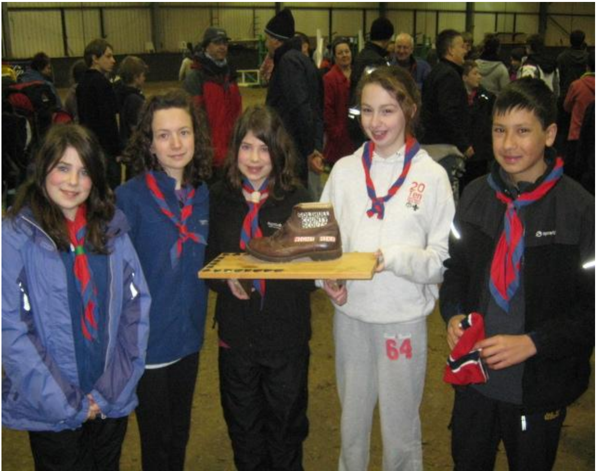
The winning team with the "Boot" trophy